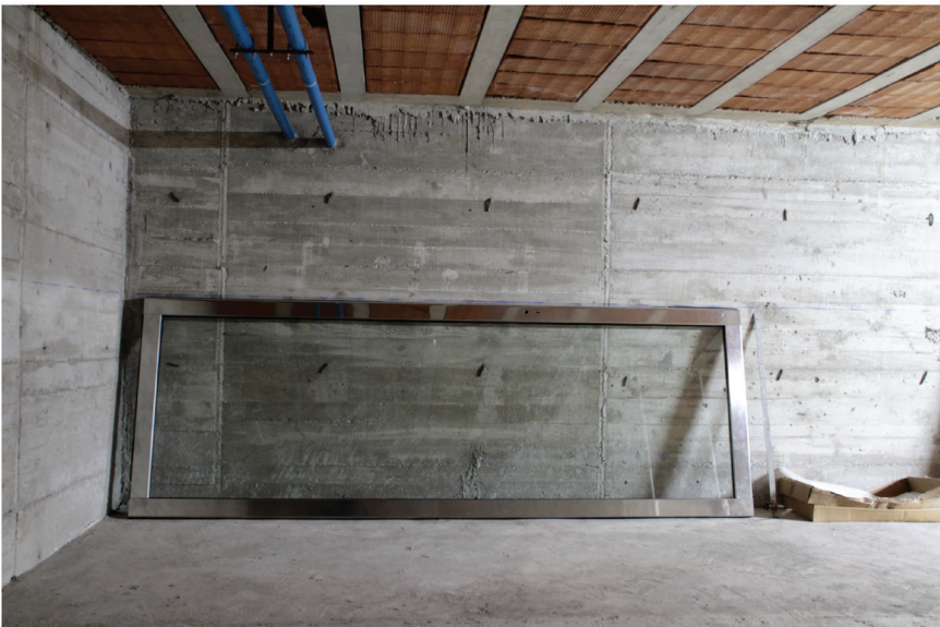
FIG. 6.11 Broken door in the basement of the Barcelona Pavilion