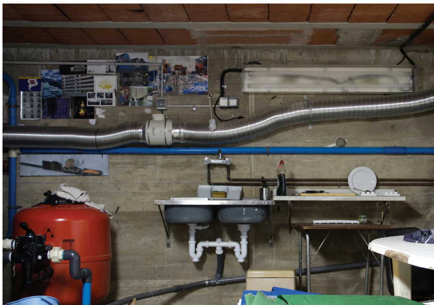
FIG. 6.9 Filtering system in the basement of the Barcelona Pavilion