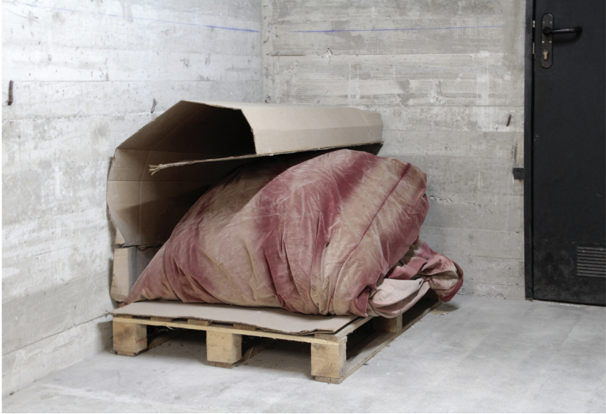
FIG. 6.4 Fading velvet curtain stored in the basement of the Barcelona Pavilion