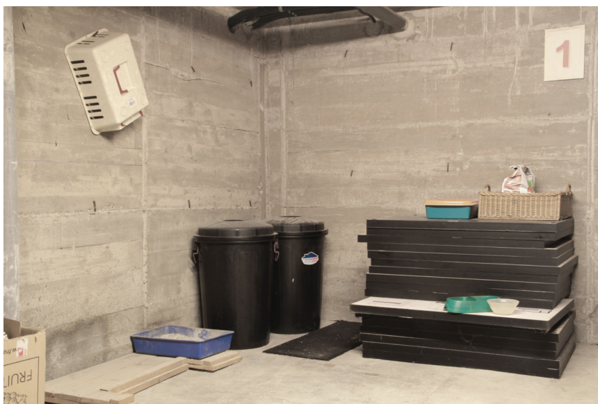
FIG. 6.7 Niebla's cat space in the basement of the Barcelona Pavilion