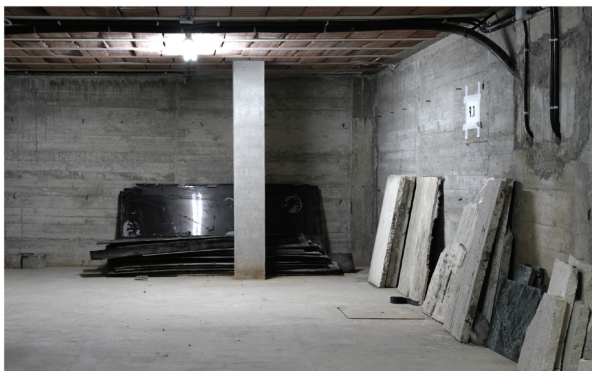
FIG. 6.10 Removed plexiglass cladding in the basement of the Barcelona Pavilion