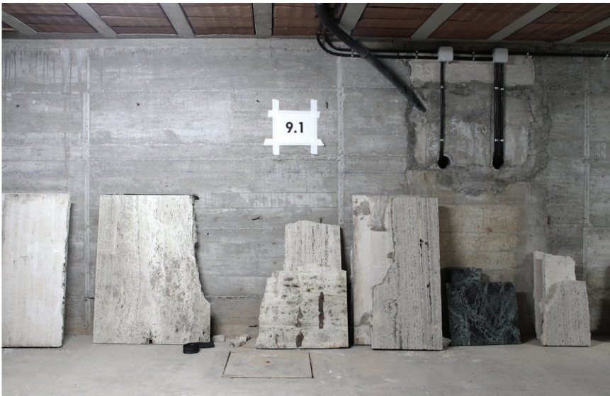
FIG. 6.3 Broken travertine slabs and remaining pieces of Alpine marble stored in the basement of the Barcelona Pavilion

The basement also shapes the Pavilion's association with different kinds of life. Early in the morning, before the Pavilion is opened to the public, Fanny Nole, a staff member (Fig. 6.6), removes the algae growing in the rainwater that accumulates in the holes of the travertine paving slabs, using for this purpose a Kärcher machine, which injects pressurised water into the holes, and then a vacuum cleaner. Both machines are placed in the basement before visitors are allowed in (Fig. 6.5). The basement is also the place where Nole has lunch, puts on her working clothes and rests. Figure 9 shows the hidden-in-the-basement machinery that filtrates and dilutes chlorine into the Pavilion's two ponds. Figure 7 shows the place where the cat Niebla (Fig. 6.8) sleeps, eats and defecates. Niebla is taken to the upper floor every night to help prevent rodent infestation.