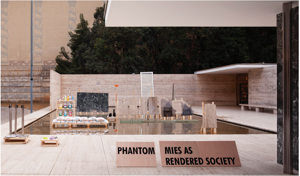
FIG. 6.13 Phantom. Mies as Rendered Society