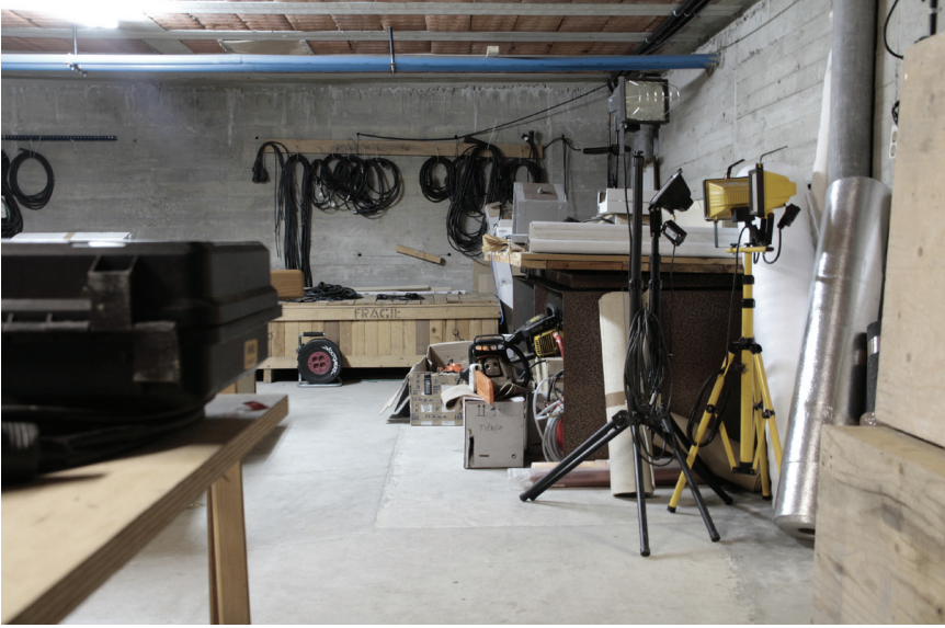
FIG. 6.12 Events equipment in the basement of the Barcelona Pavilion (photo: Andrés Jaque, 2012)

This ‘nothingness’ is the Pavilion itself, not as the all-above-ground-building that ages, breaks and fades, with spontaneously evolving aquatic ecosystems, mice and rats, produced in a tentative process of material experimentation, but as a two-storey building that is part of and contributes to producing a society of people, books, historiographies, and the performance of visiting the Pavilion itself. Thus visitors photograph it the way it is expected to be photographed, and photograph themselves within the interior of the Pavilion’s upper floor – all of them ignoring the existence of 7 its basement, by which certain presences, and certain performances, are promoted and others evacuated. In this way the basement determines the Pavilion’s aesthetics and therefore the way its social dimension is sensed. It distributes visibilities and hides the evidence that prove the Pavilion’s materiality to be the result of an iterative experimental development affected by contingency and uncertainty, and evolving in time through processes of aging, accident and emergency.