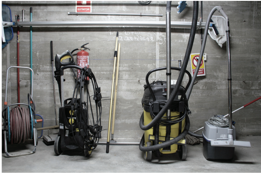
FIG. 6.5 Hoses, Kärcher machine, vacuum cleaner and mop in the basement of the Barcelona Pavilion