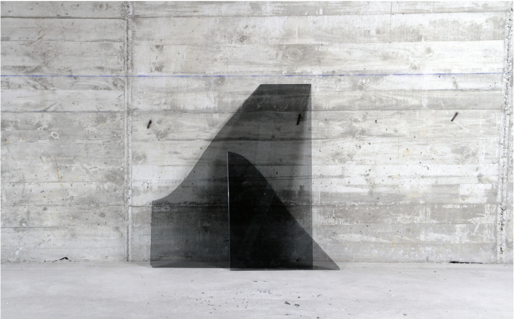
FIG. 6.2 Broken piece of tinted glass in the basement of the Barcelona Pavilion