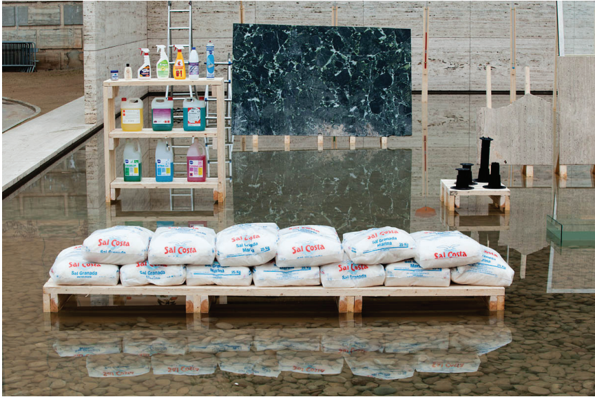
FIG. 6.15 Phantom. Mies as Rendered Society

Andrés Jaque Phantom. Mies as Rendered Society